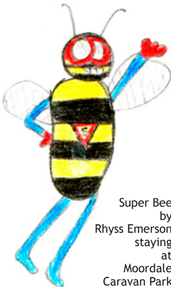
Super Bee by Rhys Emerson staying at Moordale Caravan Park