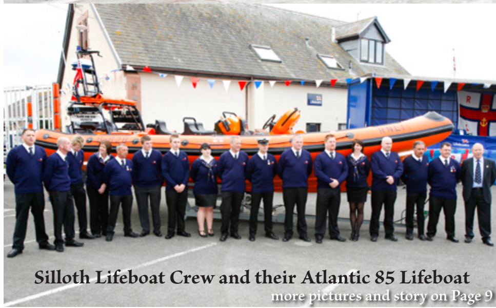
Silloth Lifeboat Crew and their Atlantic 85 Lifeboat more pictures and story on Page 9