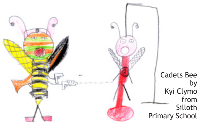
Cadets Bee by Kyli Clymo from Silloth Primary School

Both dancer are into the northern finals to be held in Blackpool in late September. Silloth Rugby Club sends both lads our best wishes.