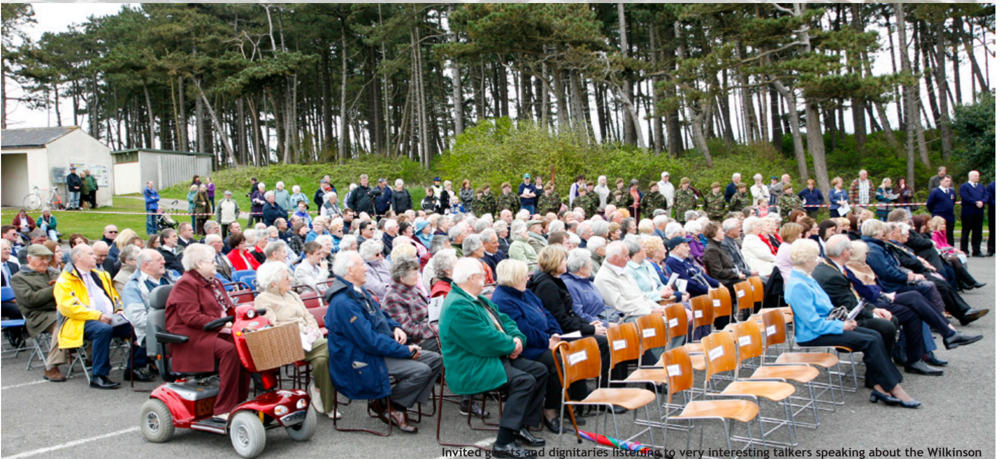
Invited guests and dignitaries listening to very interesting talkers speaking about the Wilkinson family connections with the RNLI, the Boats, the Crew and the history of Silloth Lifeboat Station

See a slideshow of over 50 photographs at www.SolwayBuzz.co.uk