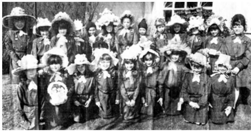
Silloth Brownies Easter Bonnets 1983