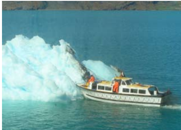
Pushing an Iceberg clear of Black Prince