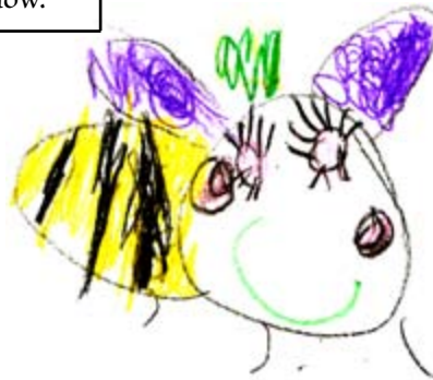
Princess Ariel by Naomi Lowden from Hylton Park Caravan Site