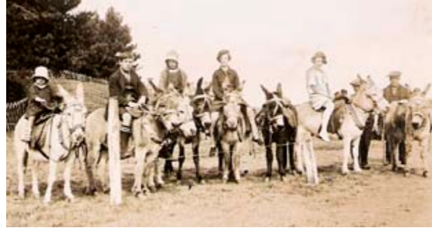
Are you in this picture? Identify yourself and you will receive a free copy of the book.

It features around three hundred photographs. Many of these were loaned to the group by Heather and Olive Wood of Skinburness Road. Their family ran the famous 'emporium' at the corner of Wampool Street for over a hundred years and were Silloth's leading publishers of post cards