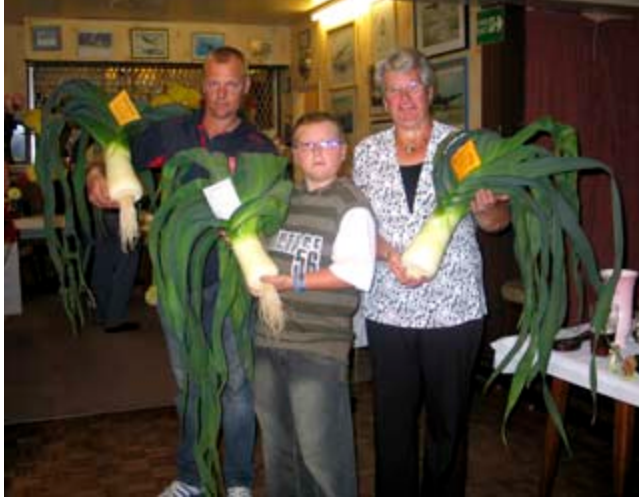
Three Generations of Leek Growers

This years show was held on Saturday 8th September in the R.A.F.A. Club where 15 members showed leeks.