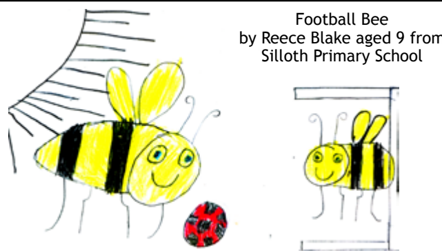
Football Bee by Reece Blake aged 9 from Silloth Primary School

The lads enjoyed their fishing course and are busy planning their next excursion to try their luck elsewhere.