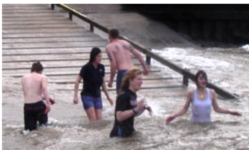
While the girls went in slowly, they will tell you they did at least go for a swim, although it didn't last long