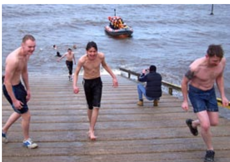
The lads got into the water first and were the fastest back up the ramp looking for warm towels

Editors comment: Perhaps in 2008 they should each be timed swimming and a prize given for the one who lasts longest. Although I think they all deserve a reward.