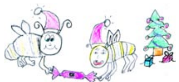
Christmas Bees by Kirsty Bell aged 5 from Silloth Primary School