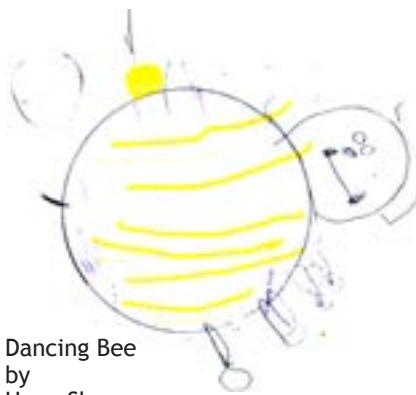
Dancing Bee by Hope Shaw aged 4 from Silloth Primary School