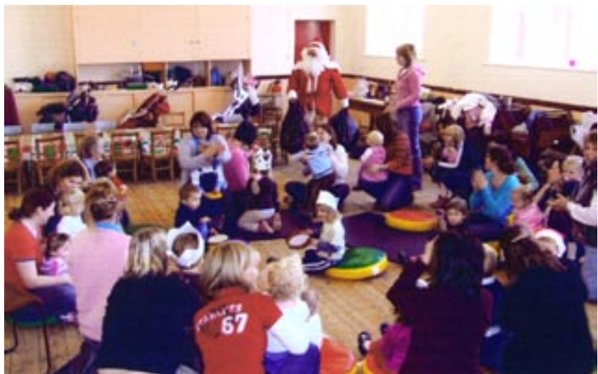
Christmas party went with a bang, the kids really had a good time. A big thank-you to Santa. The raffle raised £55 towards new toys.