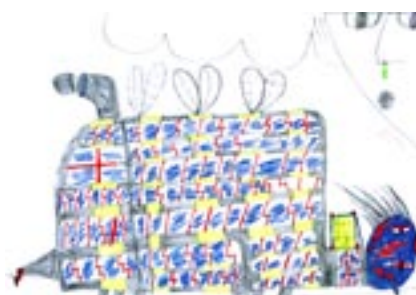
Big Bus Bee by Luke Ray aged 10 from Silloth Primary School