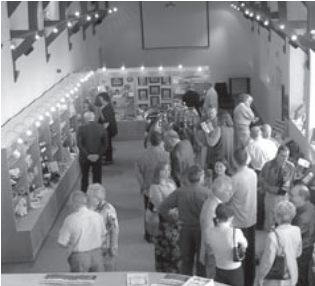
The Discovery Centre

Silloth Tourist Information have now settled in to their new home at the Solway Coast Discovery Centre.