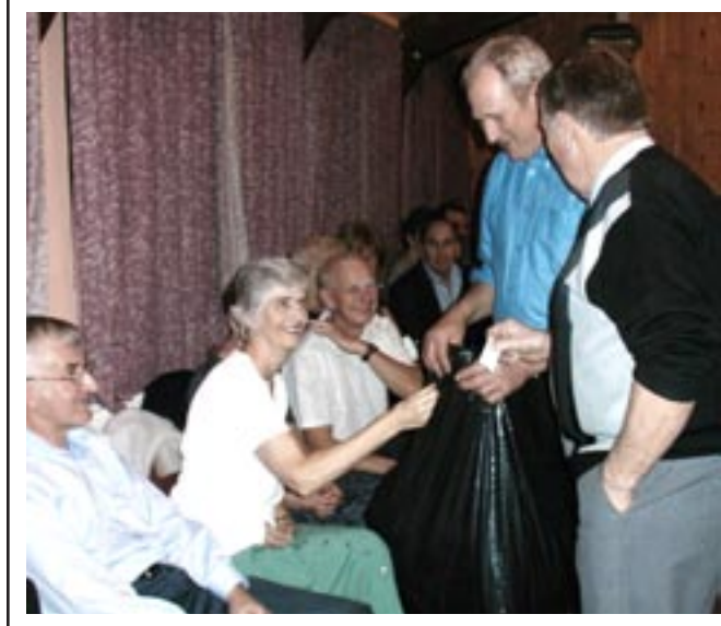
Drawing the tickets