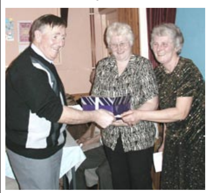
Drawing the winners

A shared supper dance was held In Mawbray Hall on 4th February with Roe Valley Band providing the music. A total of £756 was raised to be divided between Silloth Patient Care Fund & Holme St. Cuthberts Church. A good night was had by all.