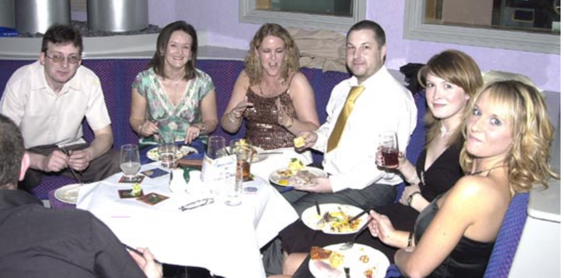
Everybody really enjoyed the food & entertainment at the Silloth Businesses event