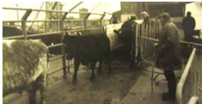
Irish cattle arriving at Silloth

Once the new lairage facility was fully up and running, it was ambitiously anticipated that it would soon be to accepting up to 3,000 head of cattle per week, with two ships arriving each day. The first of such shipments was a vessel called the 'Eemsmund', arriving with 300 animals from the Irish port of Greenore. All