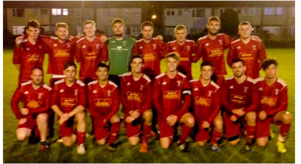
Silloth AFC after the game against Windscale Reserves in Egremont where Silloth won 7-1 in the Conway Cup