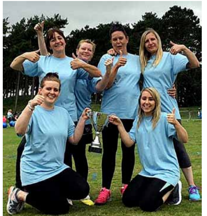
The first ever Care Home Olympics were held on Silloth Green on the 28th August. Teams representing all the Care Homes in Silloth entered and the victorious team from the Good Companions were delighted with their win.