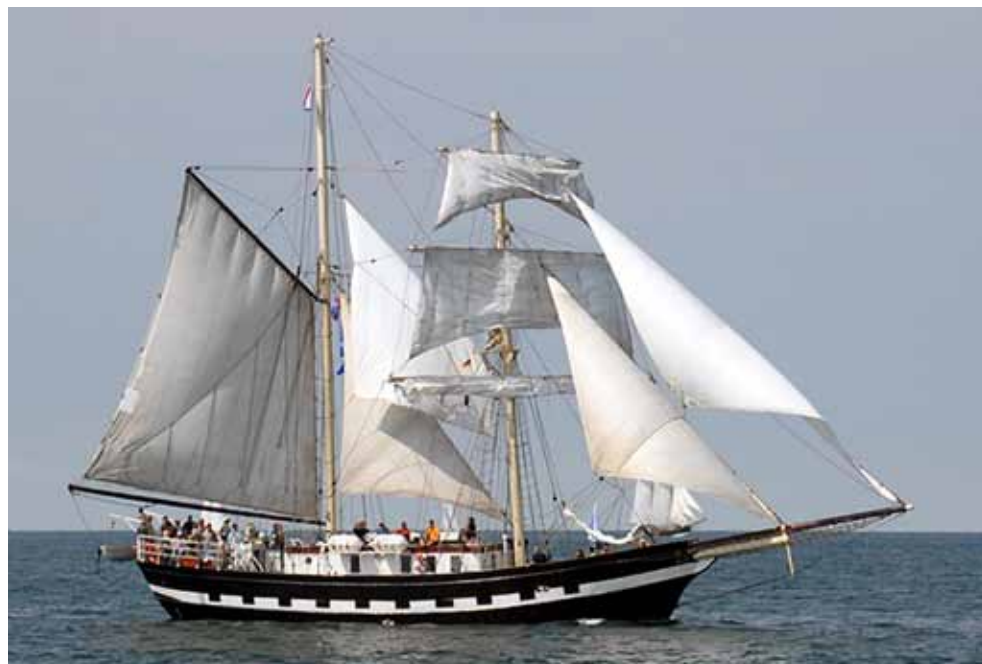
The brigantine 'La Mouline'

Details are sketchy but it appears that the 'La Mouline'