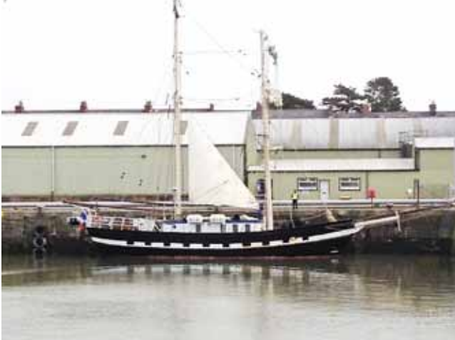
6th May 2016. The 'La Mouline' alongside

With the Solway Firth as her new home area, it is