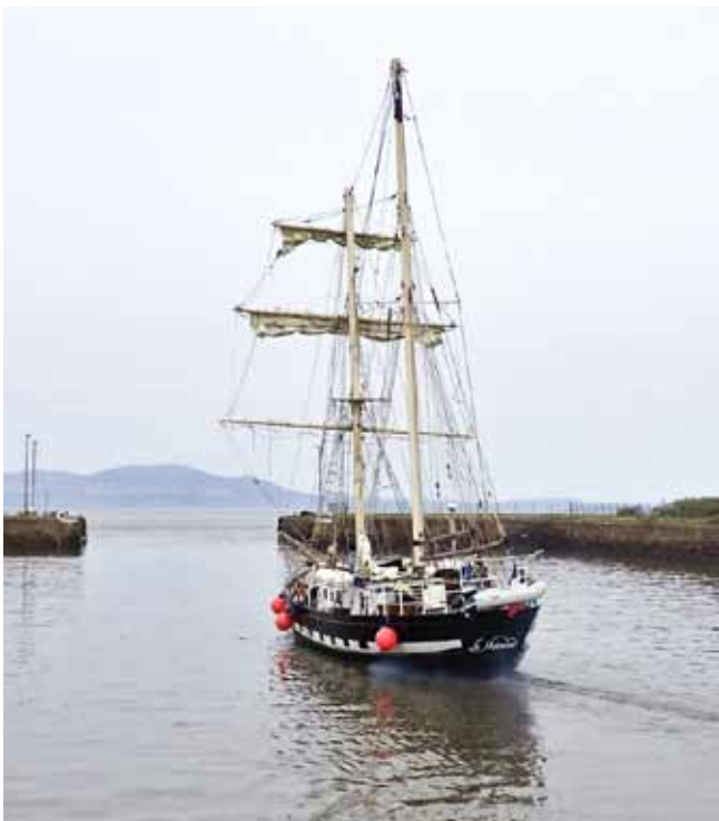
'La Mouline' sailing from Silloth to Annan

to be hoped that we will see more of this attractive sailing ship, possibly taking part in activities here at Silloth.