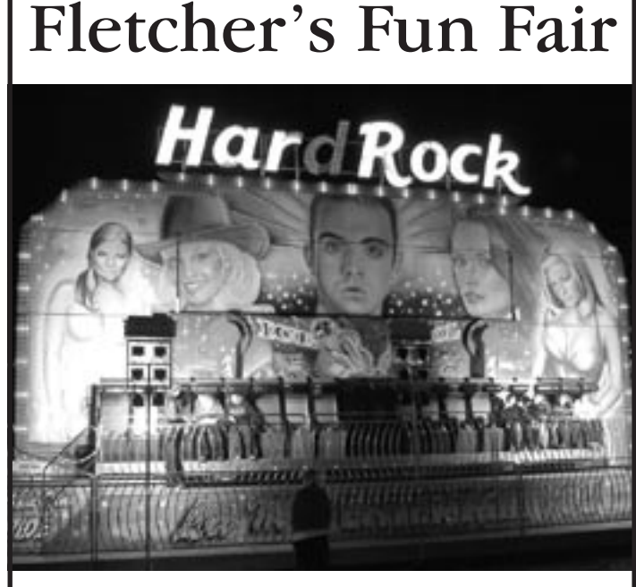
Variety of Rides for all ages

Hawthorns • Abbeytown • Tel: 016973 61637