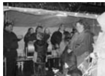
Top: Street entertainment Middle: Santas' Grotto Bottom: Silloth Rotary raising